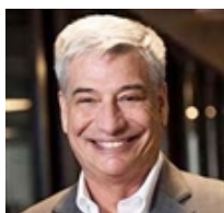
Bret Waters Startup Accelerator 4thly